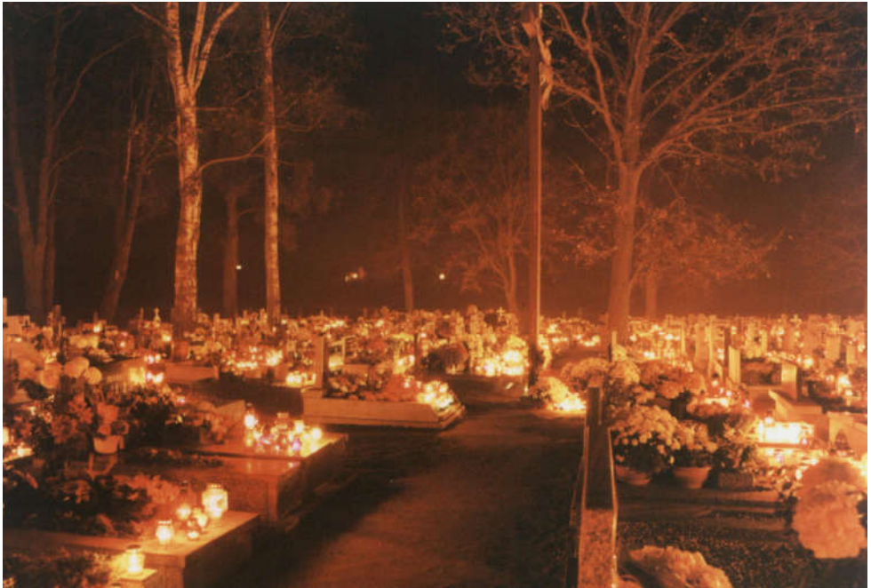
Light in the darkness

In Poland they remember their departed on All Saints Day and over Christmas, always leaving a candle burning to their memory, so the graveyards are full of light during these special days!