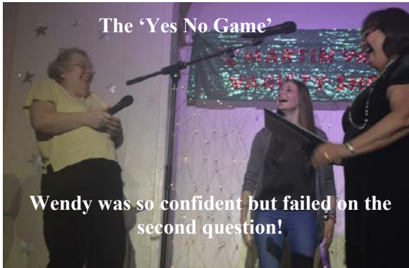
The 'Yes No Game'