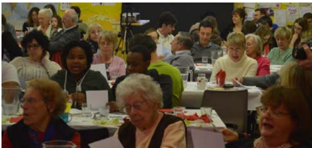
And we mustn't forget about our wonderful audience!!