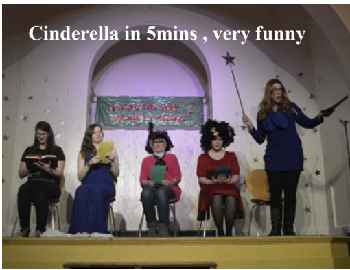
Cinderella in 5mins , very funny