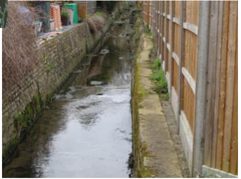
1. Banstead Woods 2. Cannon Hill Common 3. Hurst Park Molesey 4. Hurst Park Molesey 5. Pond in Isabella Plantation Richmond Park 6. Isabella Plantation Richmond Park 7. Wisley 8. Pyl Brook (A different view)