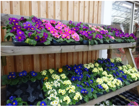
1. Merton and Sutton Cemetery, 2. Bug House Morden Park, 3. Swan in Richmond Park, 4. Fox in alleyway near St Mary's Avenue, 5. Wisley, 6. Banstead Woods, 7. Banstead Woods, 8. Garden Centre Morden Hall Park.