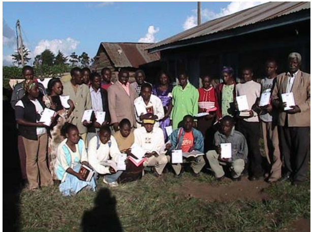
Graduation day at Kimende on the 11 th October 2008