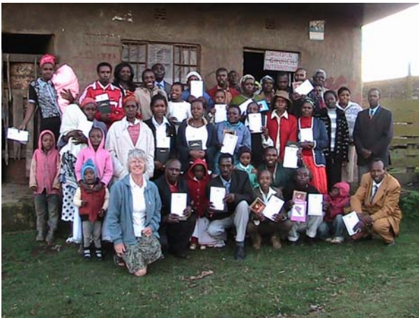
Graduation day at Magina on the 26 th October 2008