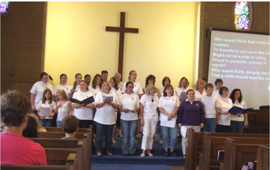
The Circuit Youth Choir that became SIGMA