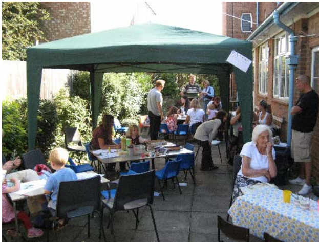
Martin Way Me