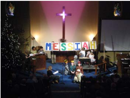
Sunday Club Christmas Presentation