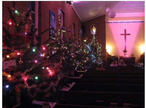
Christmas Tree Festival