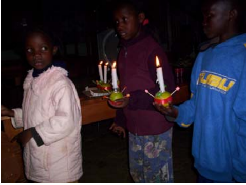
The Christingle Service