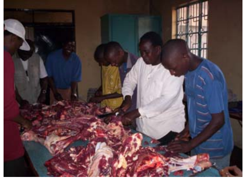
Men in the kitchen!